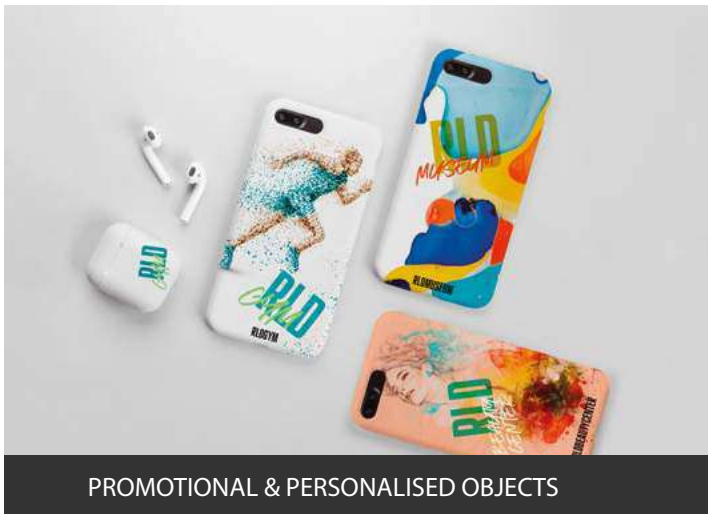
PROMOTIONAL & PERSONALISED OBJECTS