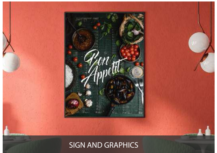
SIGN AND GRAPHICS