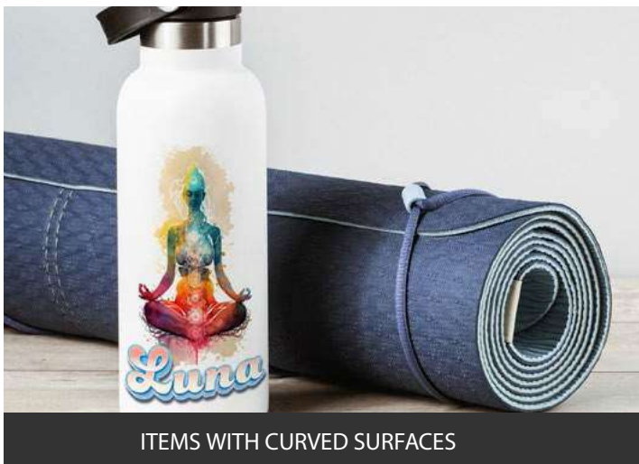
ITEMS WITH CURVED SURFACES