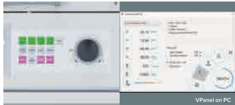
VPanel on PC

Popular in Industry and Education, the intuitive “SRP Player” CAM software has been updated to match the advanced functions of the MDX-50. Milling settings can be configured in five simple steps, making operation straightforward even for those new to milling.